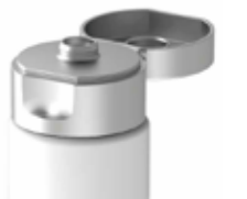
Renewal Flip-top Edge Tube

■ Foil Seal | ● Metalizing Cap | ★ Metal Cap | ✦ Coating / Offset / Hot Stamping / Silk Screen