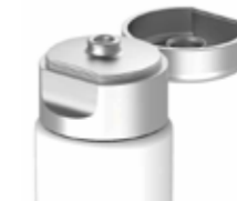
Renewal Flip-top Tube