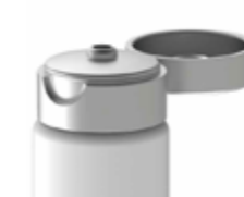
Flip-top Standard Tube